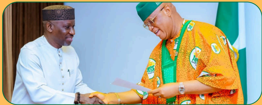
L-R: Minister of State for Petroleum Resources (Gas), Rt. Hon. Ekperikpe Ekpo, PhD., with His Excellency, the Governor of Akwa Ibom State, Pastor Umo Eno, PhD in Uyo.