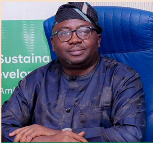
Minister of Power, Adebayo Adedun

Nigeria's Minister of Power, Adebayo Adedun, has condemned recorded incidences of load rejection by power distribution companies, which he said has contributed significantly to the instability of the national grid. The Minister disclosed this while declaring a recent peak of 5,170 megawatts in power generation, which had to be reduced by 1,400 megawatts due to the rejection of supply by DISCOs. "This is regrettable considering that the government is on course